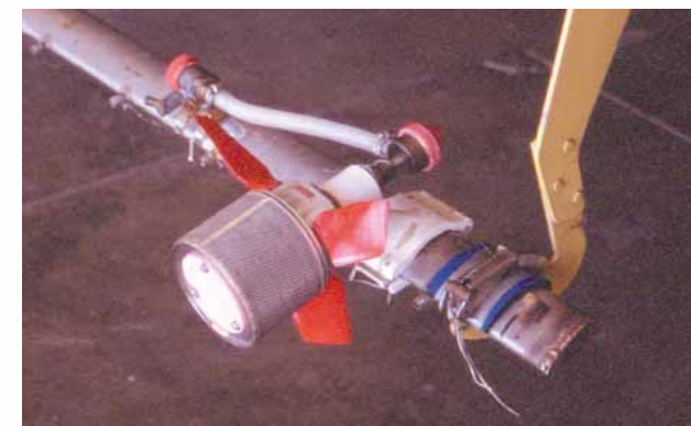
Micronair Rotary Atomizer

Supply Lines – Polypropylene or stainless steel tubing is recommended for use as hoses for moving product from the tank to the nozzles.