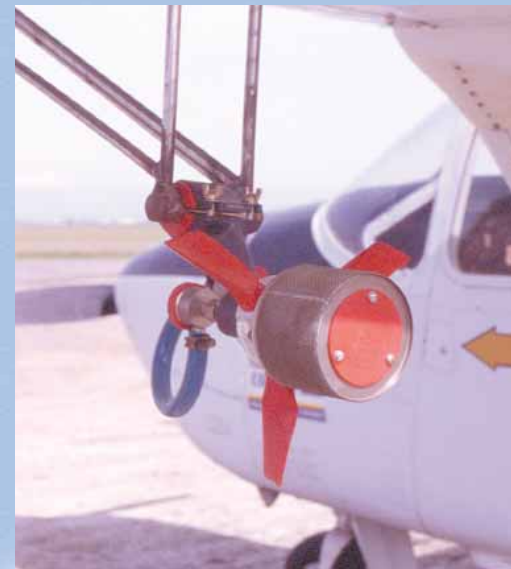
Micronair system setup for mosquito control

For many aerial applicators, using a completely separate tank, pump, hose, nozzle and boom system with appropriate dry-breaks and valves, is a way to more quickly and conveniently convert the aircraft for mosquito-control operations. This reduces downtime for flushing and rinsing of tanks and lines between normal ag operations and mosquito-control applications.